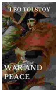
Image credit: "Book cover of War and Peace by Leo Tolstoy" by World Literature Today is licensed under CC BY-SA 2.0