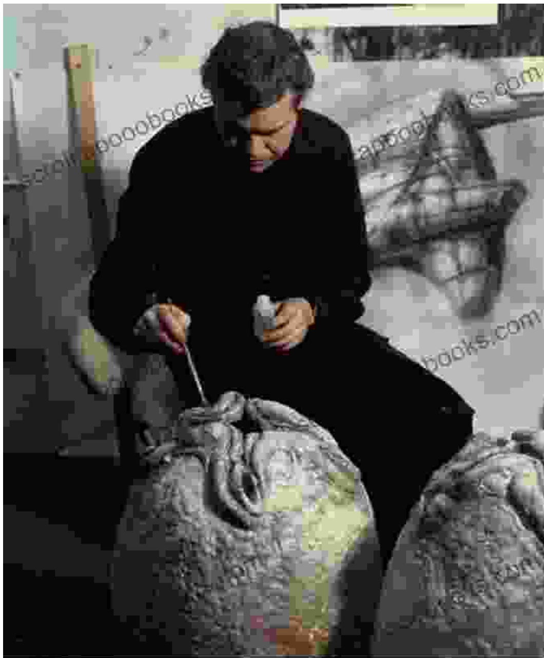
Manny the Micronator by Bolaji O

We can all learn from Bahun's example. We can all make a difference in the world, no matter how small. We can all be micronators.