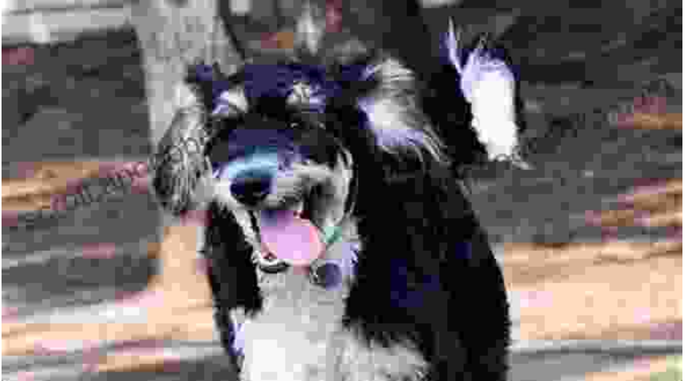
[Image 2 Caption: A majestic adult Bernedoodle running freely in a field, its tri-colored coat billowing in the wind, exuding an air of joy and vitality.]