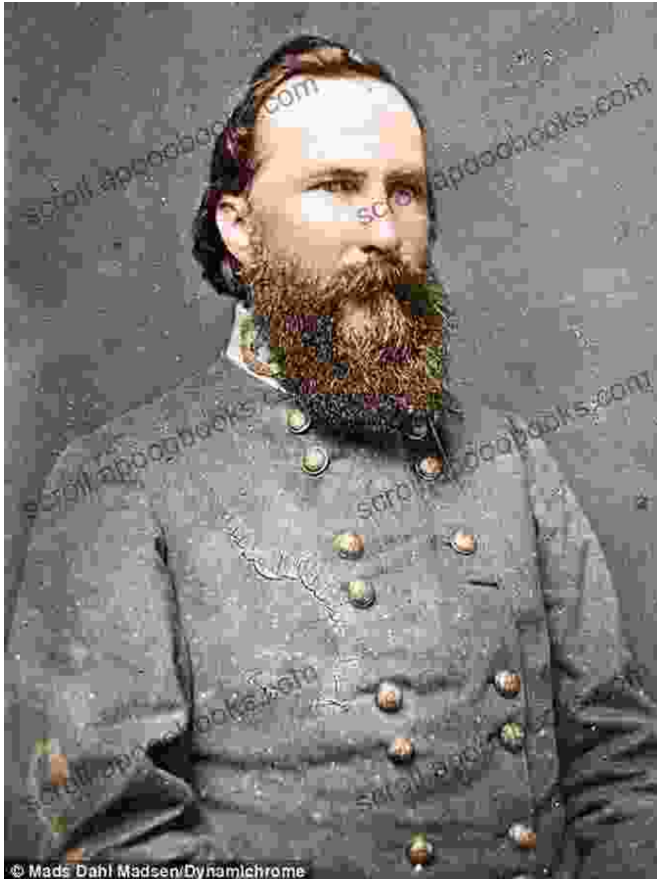
James Longstreet, the pragmatic Confederate general

Robert E. Lee: A military genius known for his strategic brilliance and unwavering sense of duty. Despite his victories, Lee grapples with the moral complexities of slavery and the personal toll of leading a war against his own country.